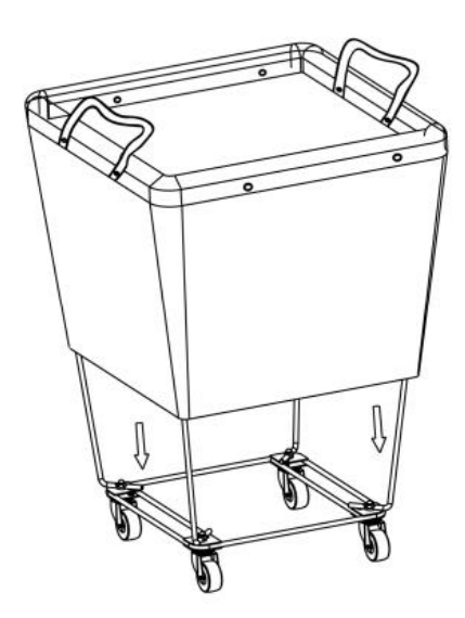
Step 5: Fix the top frame to the bracket with screws.

Step 2: Attach the four plastic parts to each corner of the top frame.